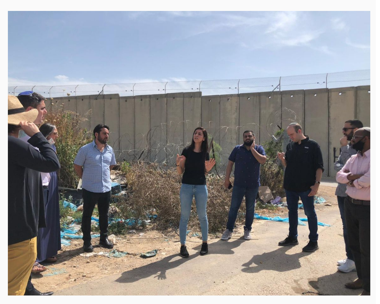
Diverse Israeli leaders in the 120 Program on a recent border tour (with social distance)

In these challenging times, our work continues. We present to you the following updates from our work in the past few months. Thank you for your continued support.