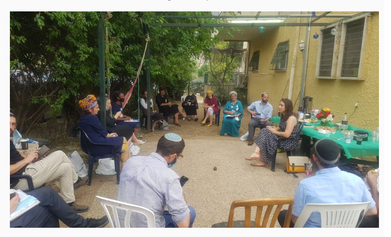
A recent socially-distanced program meeting

Both the first and second program cohorts have continued meeting virtually and inperson.